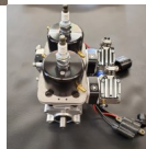
GZR 54.4cc 2022 Billit PRO-MOD IN-LINE racing engine